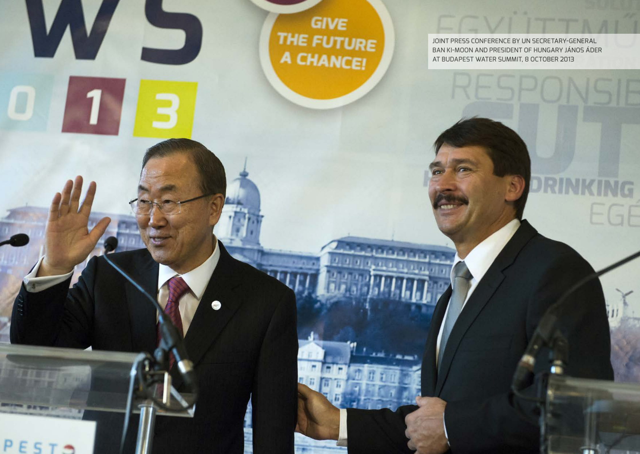
JOINT PRESS CONFERENCE BY UN SECRETARY-GENERAL BAN KI-MOON AND PRESIDENT OF HUNGARY JÁNOS ÁDER AT BUDAPEST WATER SUMMIT, 8 OCTOBER 2013